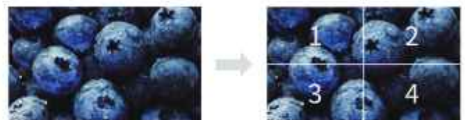
4K Square Division (SQD) : Quadrant based segmentation